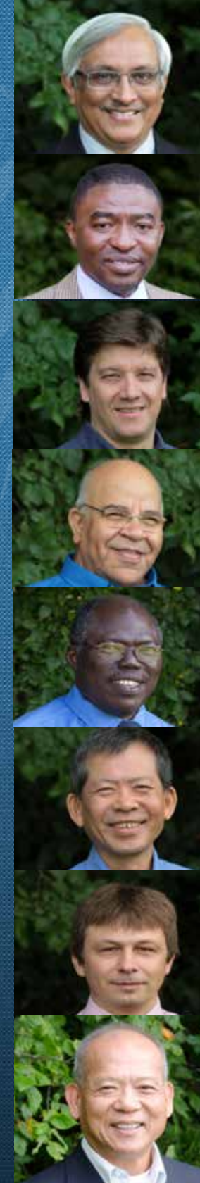
International Scope, Singular Focus on Theological Education, Evangelical & Non-Denominational Convictions

RDs are the face of OC to our partners around the world, who perceive us not as a Western organization, but one whose heart and soul resonate with their own regions. RDs are OC's eyes and ears, assisting the organization in gaining a global perspective on theological education while at the same time providing a deep, authentic understanding of local contexts.